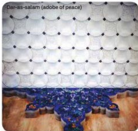
Dar-as-salam (adobe of peace)