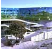
photo from the hotel

Vivanta by Taj, Bangalore Warner Wong Design