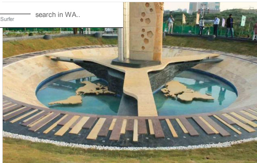
Photographer Ruchika grover