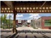
Chicago, Illinois, United States Wheeler Kearns Architects

Tags: stone designers , facade , sculptures , hardscape , landscape , water features